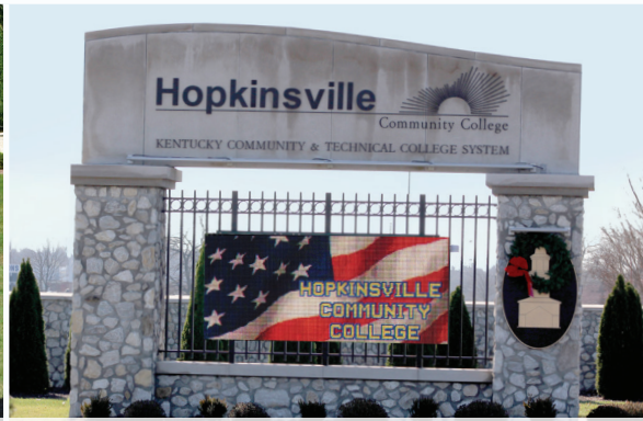
16mm 80x192, 4'2" x 10'