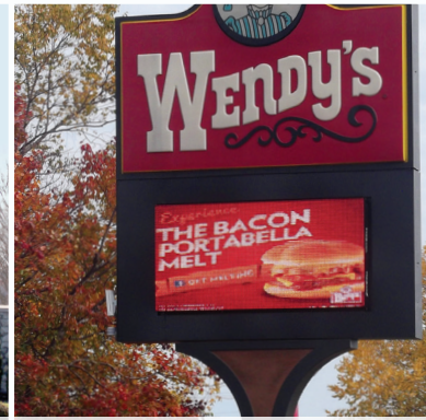
16mm 80x160, 4'2" x 8'4"